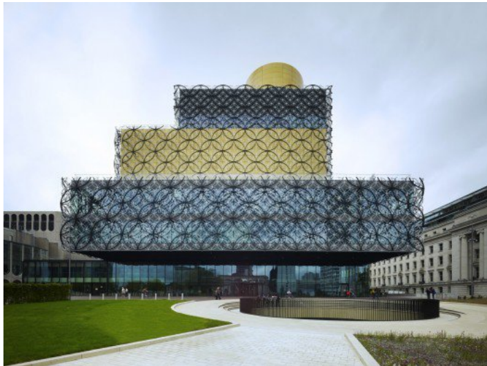
Library of Birmingham / Mecanoo.