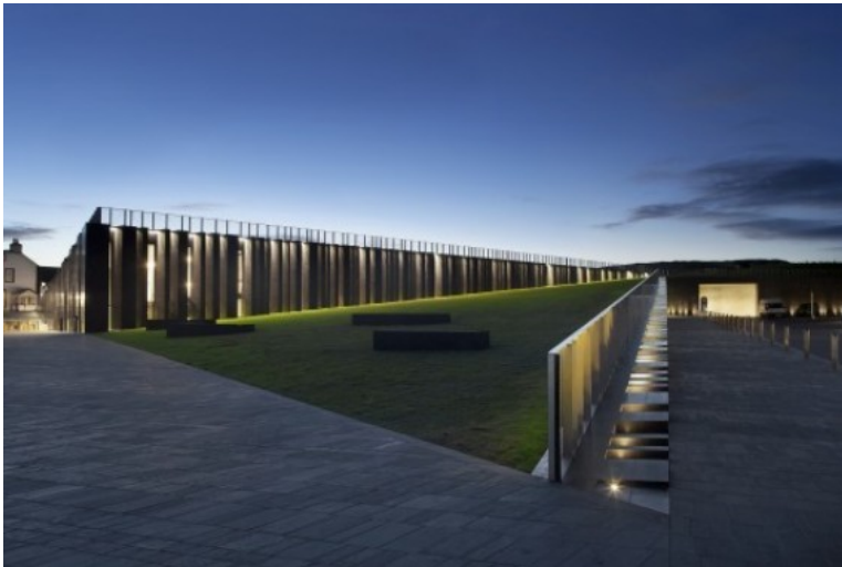
Giants Causeway Visitor Centre / Heneghan & Peng Architects.